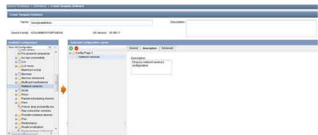
Figure 2: Configuration Templates