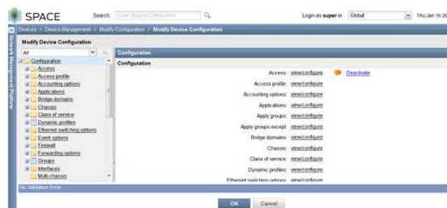
Figure 4: Configuration Editor