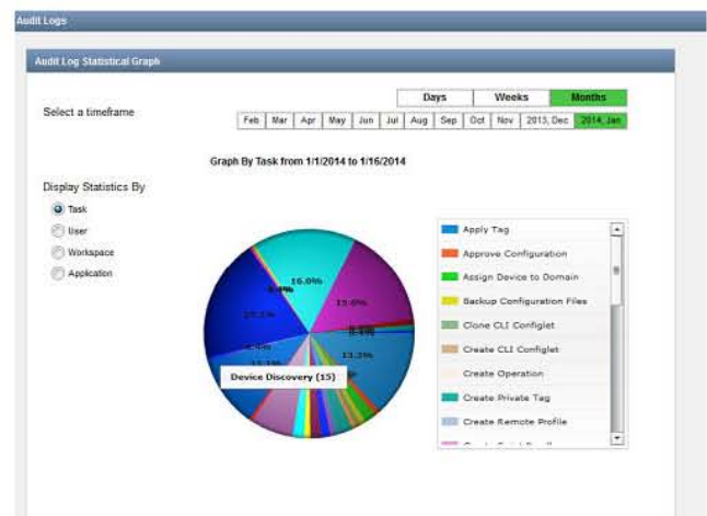
Figure 3: Audit Log