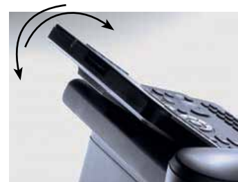
Fully adjustable display for a clear and comfortable viewing angle, from wherever you're looking.